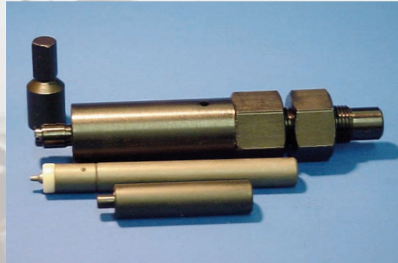
Ring locked fluid fittings require special tooling for installation and removal. FDI stocks the full line of tools for your applications.